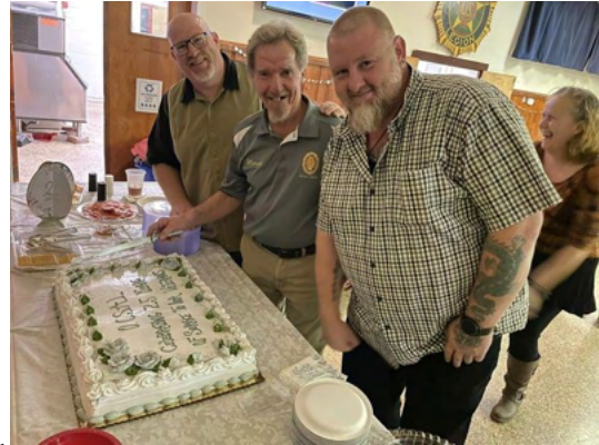
The SAL from the Great County of Ocean celebrated their 25 th Anniversary 12-Nov at New Egypt Post 455.