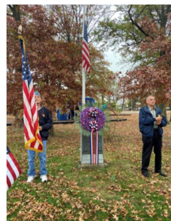
Linden Post 102