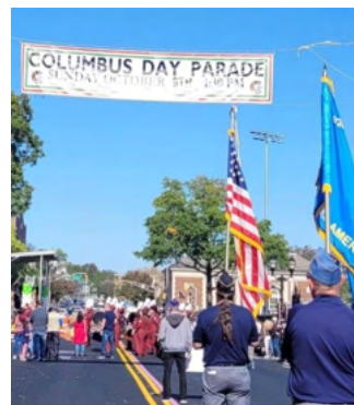
Always on the move, Belleville Legion 105 Family march in Belleville's Columbus Day Parade on 9-October.