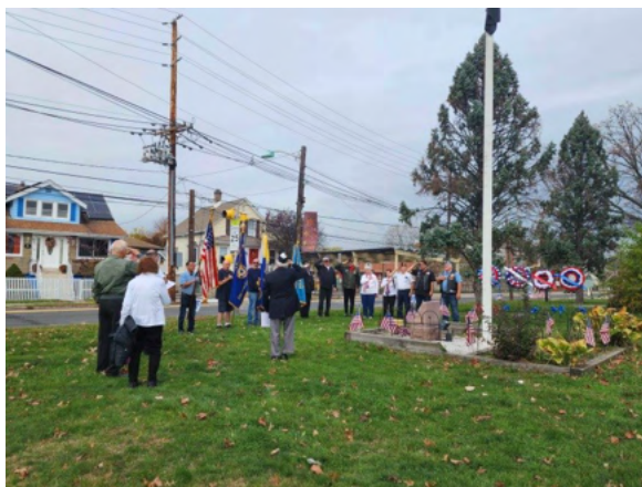
Little Ferry Post 310