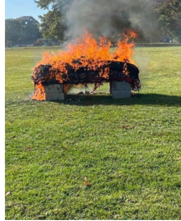
A Flag Retirement was held at Edison Father & Son Post 435 on 22-Oct. Thank you to all who came to show their respect for our nation's flag. A special thanks goes to our SAL for putting the event together.