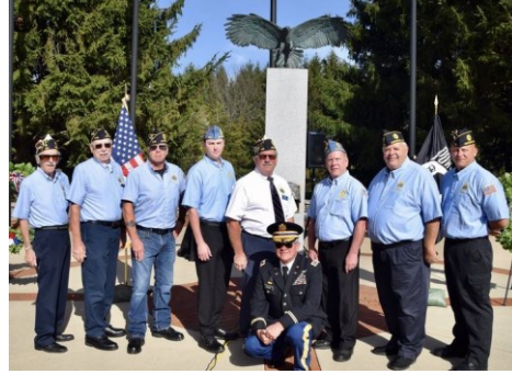
(Left) Hopewell Post and Squadron 339 Rifle Squad, and (Right) Ready for Veterans Day.