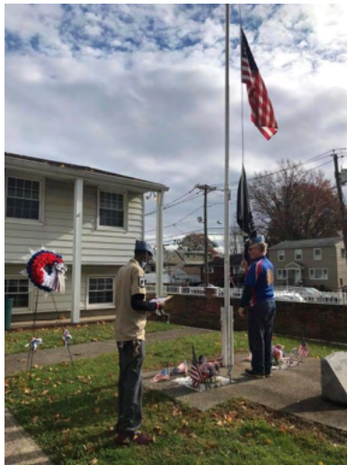
Saddle Brook Post 415